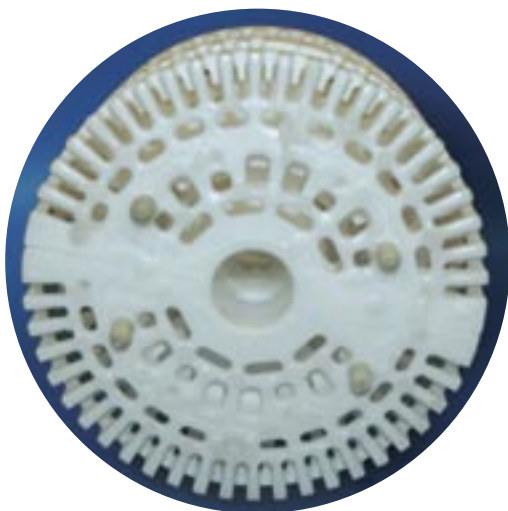
PATHOS RACK AFTER PROCESSING