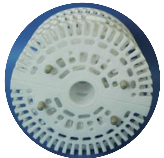
AFTER 7' CLEANING WITH HISTOMATE