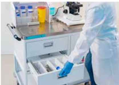
Two large volume drawers to store items needed for the procedure