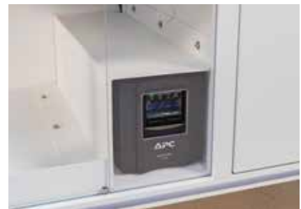
On board UPS Universal Power Supply