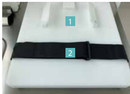
1. Brackets for Olympus CX23 microscope 2. Strap for holding your own microscope