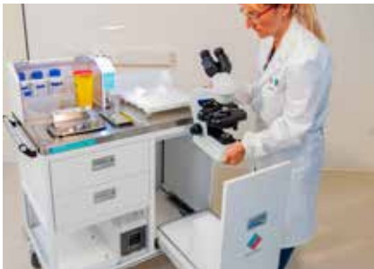
Easy dismantling of microscope for transfer to and from laboratory