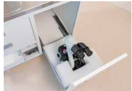
Safe transfer whenever required