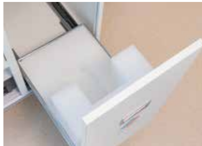
Preformed foam support to hold microscope during transfer