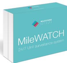
MileWATCH: 24/7 Monitoring & Tracking System