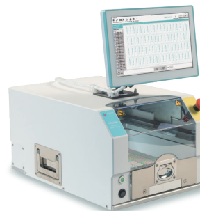
T-Tracker: Automatic Rack Scanner