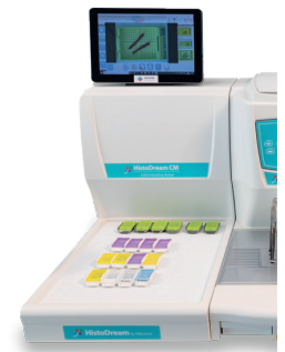
HistoDream TS: Biospecimen Tracking System