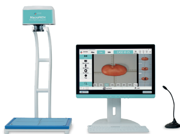
MacroPATH: Digital Imaging System