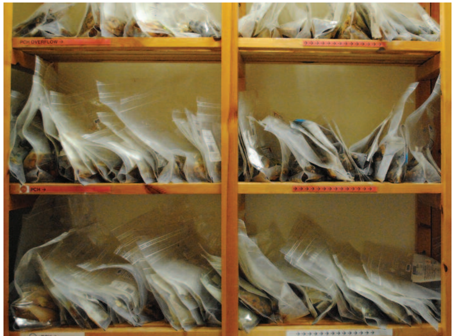
Fig 4. Bags are resealed on the SealSAFE instrument and stored in the specimen archiving room.

The vast majority of specimen types are collected by theatres at RGH and PCH, including mastectomies, bowel resections, ovarian cysts, gall bladders and prostate chippings. The key to a successful installation and training lies in clear and open communication with all interested parties, says Gerrard Fletcher (Cellular Pathology Lead Medical Laboratory Assistant). It is important to ensure dates are arranged well in advance with clear start/finish times. Prior to installation, meetings were held between theatres, the laboratory and Menarini Diagnostics to address concerns about the system