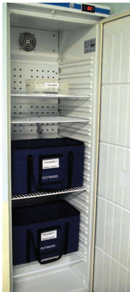
Fig 1. Surgical specimens sealed in a dedicated vacuum bag are placed in a refrigerator at 4°C until transport to the laboratory takes place.

An innovative vacuum packing solution has been adopted in order to reduce formalin use and exposure throughout the Cwm Taf Morgannwg University Health Board in Wales, as the following overview of progress illustrates.