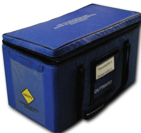
Fig 2. Specimens are transported in a cool box and are tracked using a temperature monitoring system supplied with the TissueSAFE.