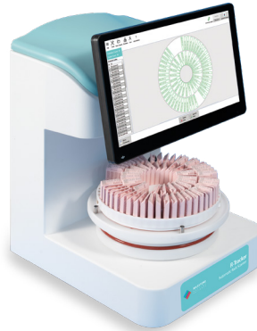
with built-in PC and monitor