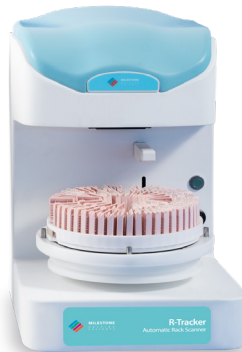
without PC and monitor

Utilize MileWATCH or your laboratory's LIS system for documentation