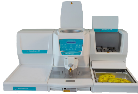
without HistoDream TS