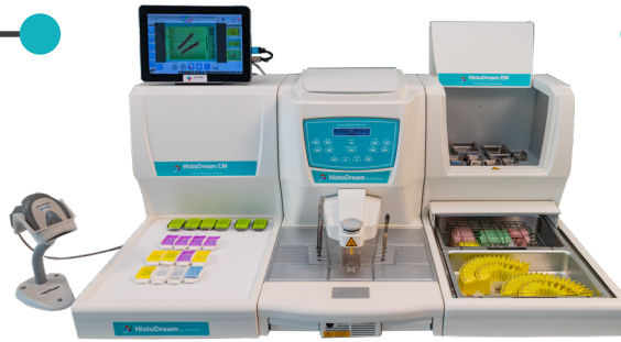
with HistoDream TS

View gross images of cassettes with HistoDream TS for full traceability